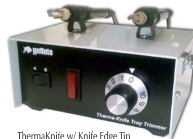
ThermaKnife w/ Knife Edge Tip